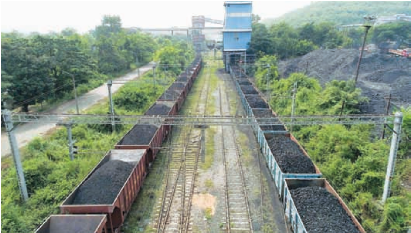
Coal dispatches by Railways : Manuguru CHP