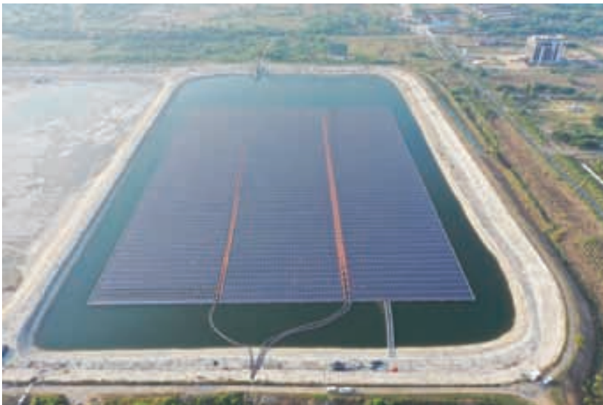
Floating Solar Plant (5 MW) commissioned at Singareni Thermal Power Plant