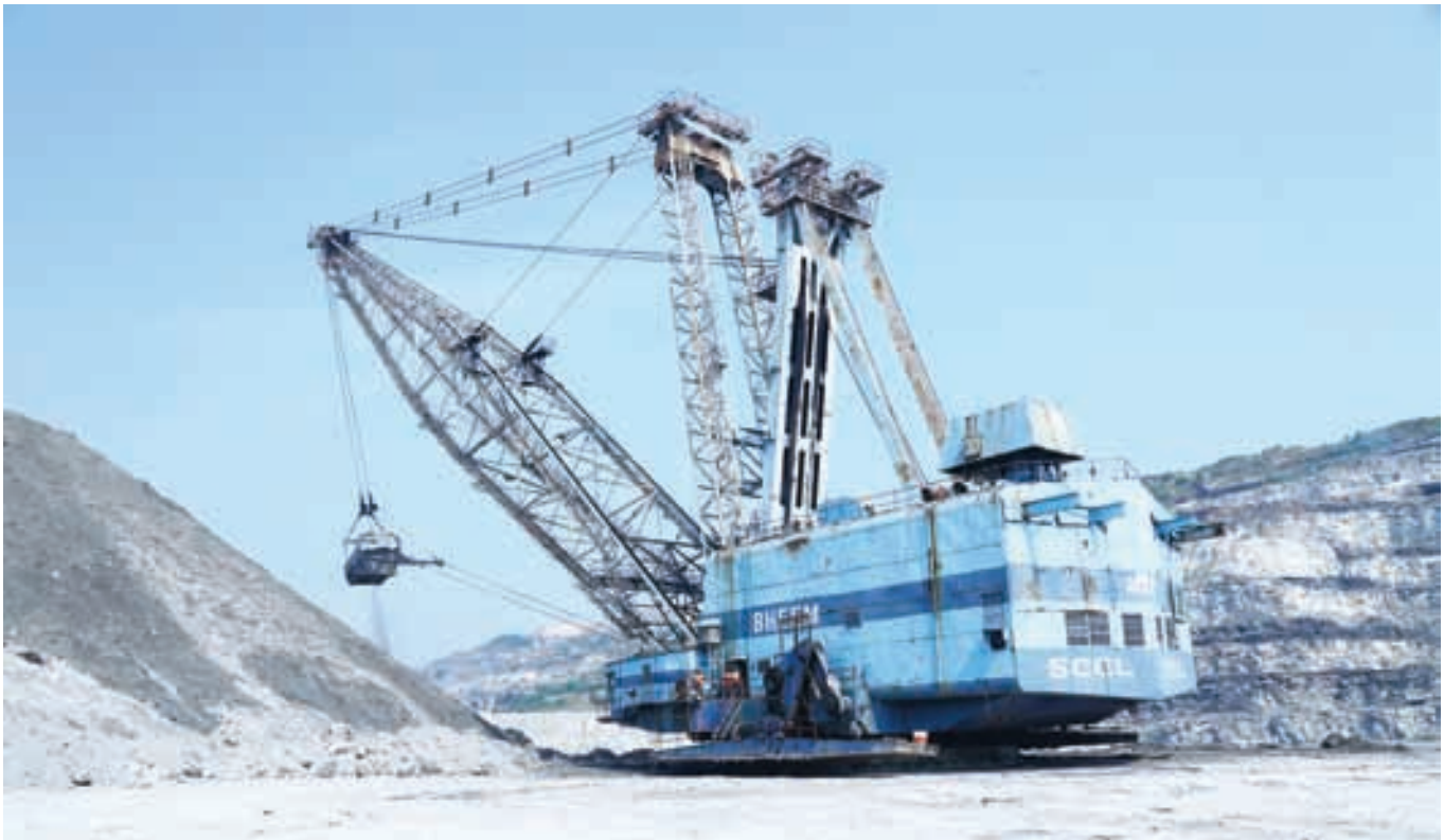
Dragline Machine in operation at RG OC-3