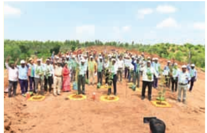
Plantation Programme at GKOC, KGM area