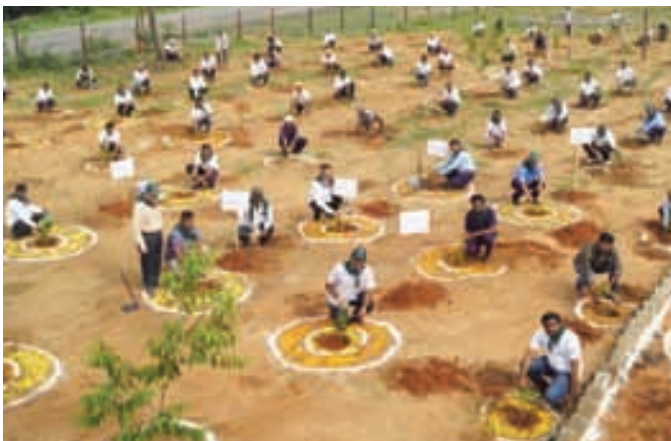
Plantation Programme at SRP area