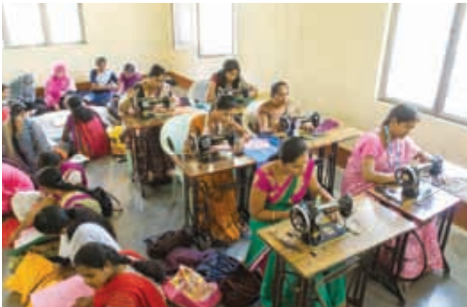
Self employment training programs for women