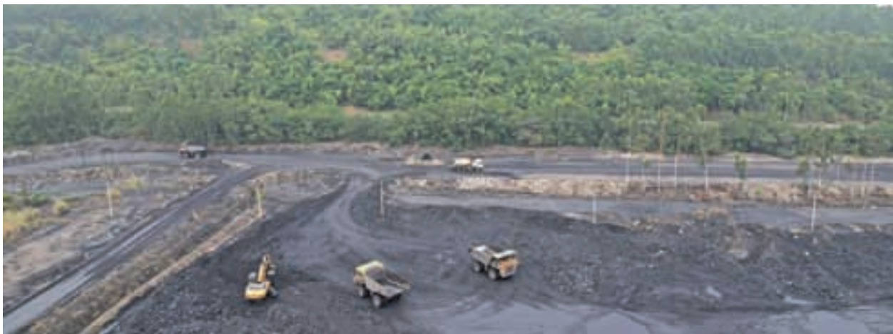
JVR OC Over Burden dump with plantation