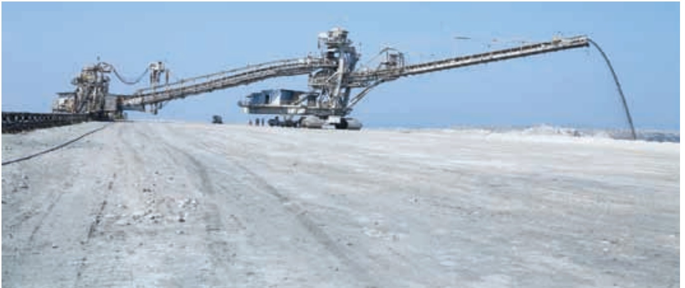
Spreader of the Input Crusher and Conveyor in RG OC-2 (RG-3 Area)