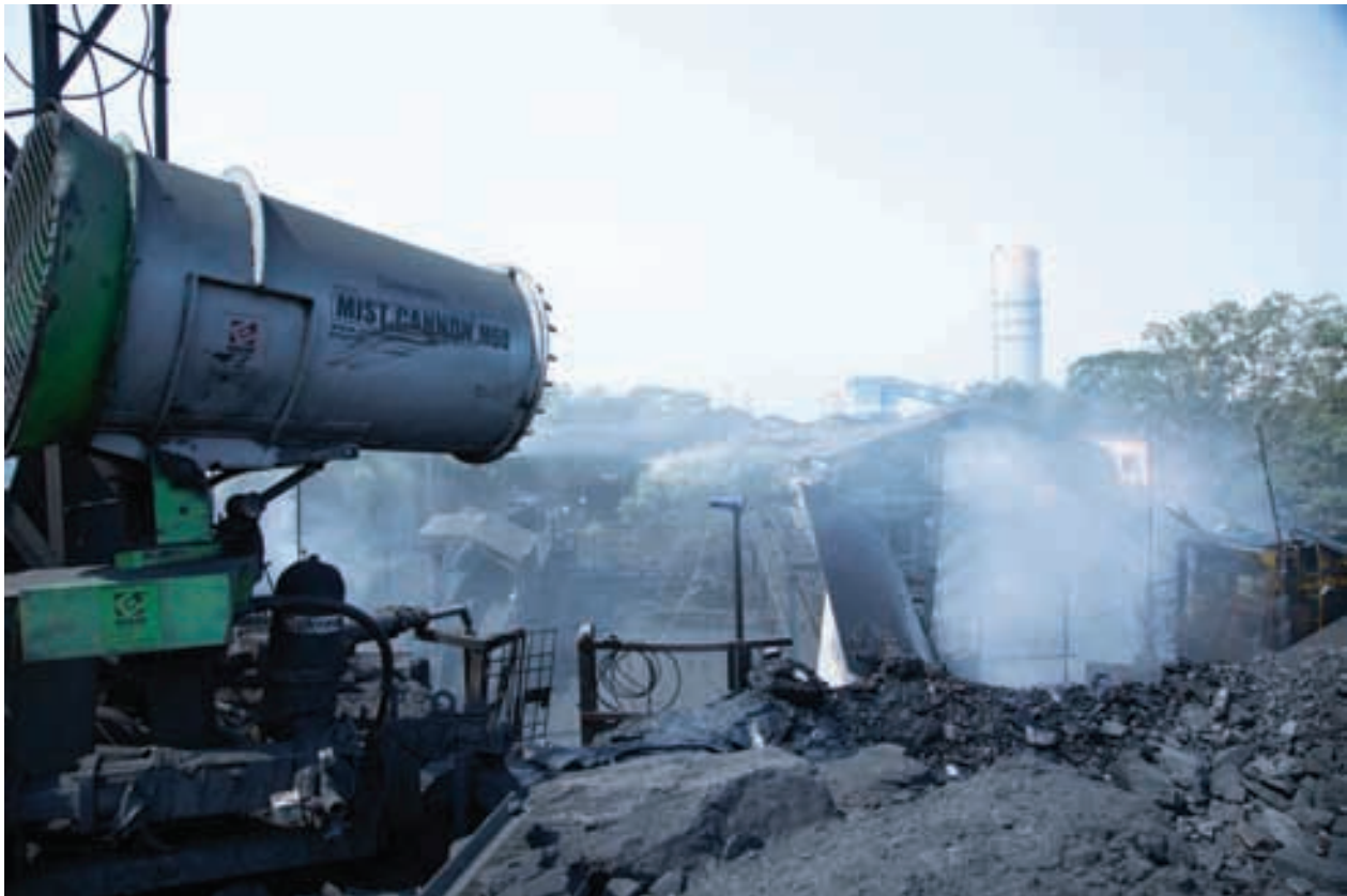
Dust suppression with mist cannons at coal bunkers (RG OC-3 CHP)