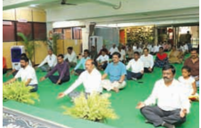
Yoga Training classes conducted for 100 days as part of International Yoga Day and Azadi Ka Amrut Mahotsav