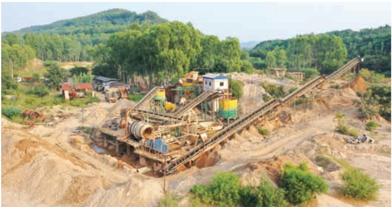
Sand from Overburden material: POB Plant at Bhupalapalli area

14.2 The effect of changes/modifications in the Accounting Policies and Correction of Material Prior Period Errors as mentioned at Note No.39.9 and 39.6 have been carried out by restating each of the affected financial statement line items for prior periods as per Ind AS-8. The impact of the restatement on the Company's Consolidated Financial Statements is furnished hereunder: