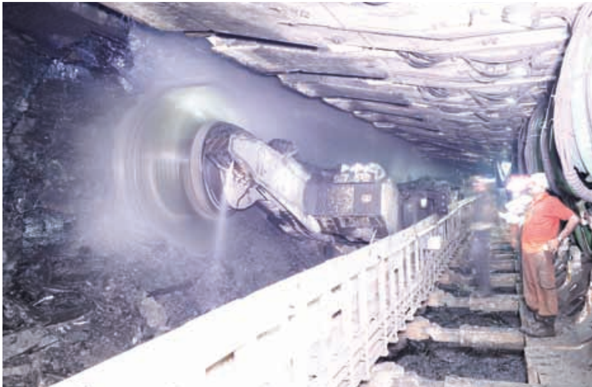
Priority to Eco friendly mining : Shearer cutting coal in Adriyala Longwall Panel