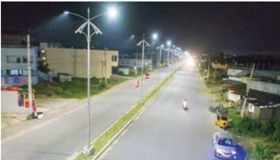
Roads and street lighting provided under CSR activities