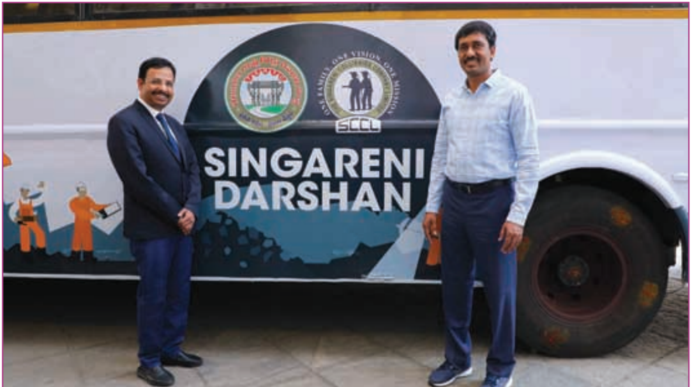
"Singareni Darshan" a mine visiting tour program launched by TSRTC

38A.1 The above amounts include, increase in the Actuarial Valuation as on the Reporting Date due to experience adjustment on account of JBCCI wage agreement concluded for NCWA-XI on 20.05.2023, (i.e. Gratuity-Rs.359.87 Crore, Leave Encashment (vesting) - Rs.76.41 Crore). The incremental liability is transacted during the year considering the same as an 'Adjusting Event After the Reporting Date' as per the provisions of Ind AS-10 (Refer Note No.22.11).