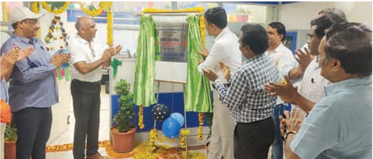
Inauguration of LOCHANA-Auditors Room at Corporate F&A Department by Director (Finance)