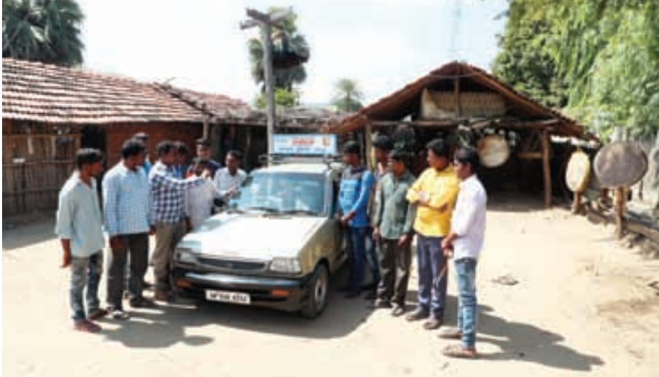
Free Vocational Training programs conducted for unemployed tribal youth near Singareni Areas by Singareni Sewa Samiti