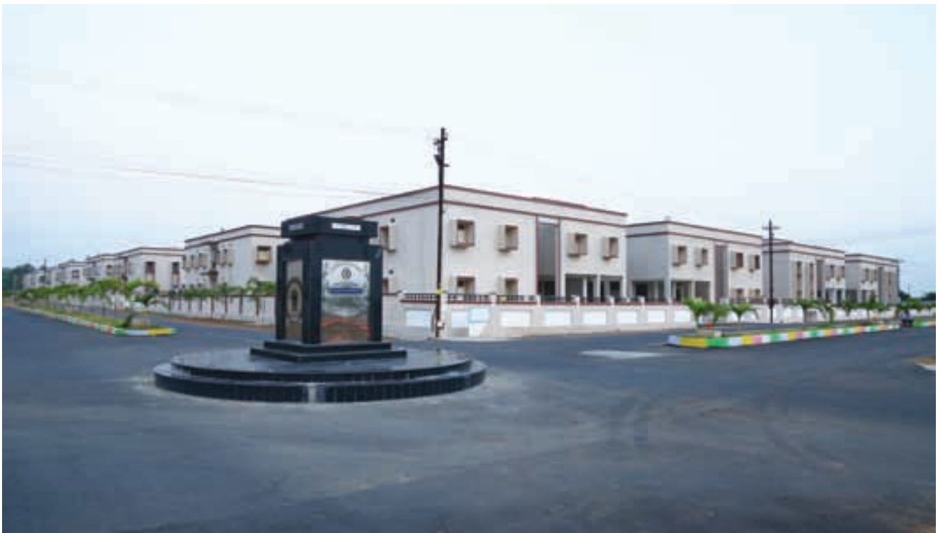
Newly built Double bedroom residential quarters at Bhupalpalli Area