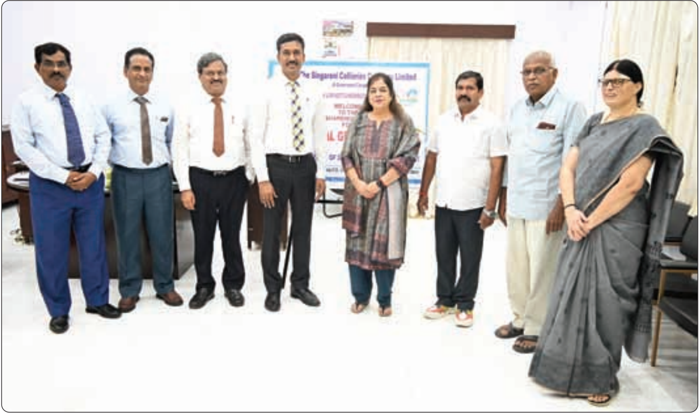
102 nd Annual General Meeting of SCCL held on 29.09.2023 at Registered Office, Kothagudem