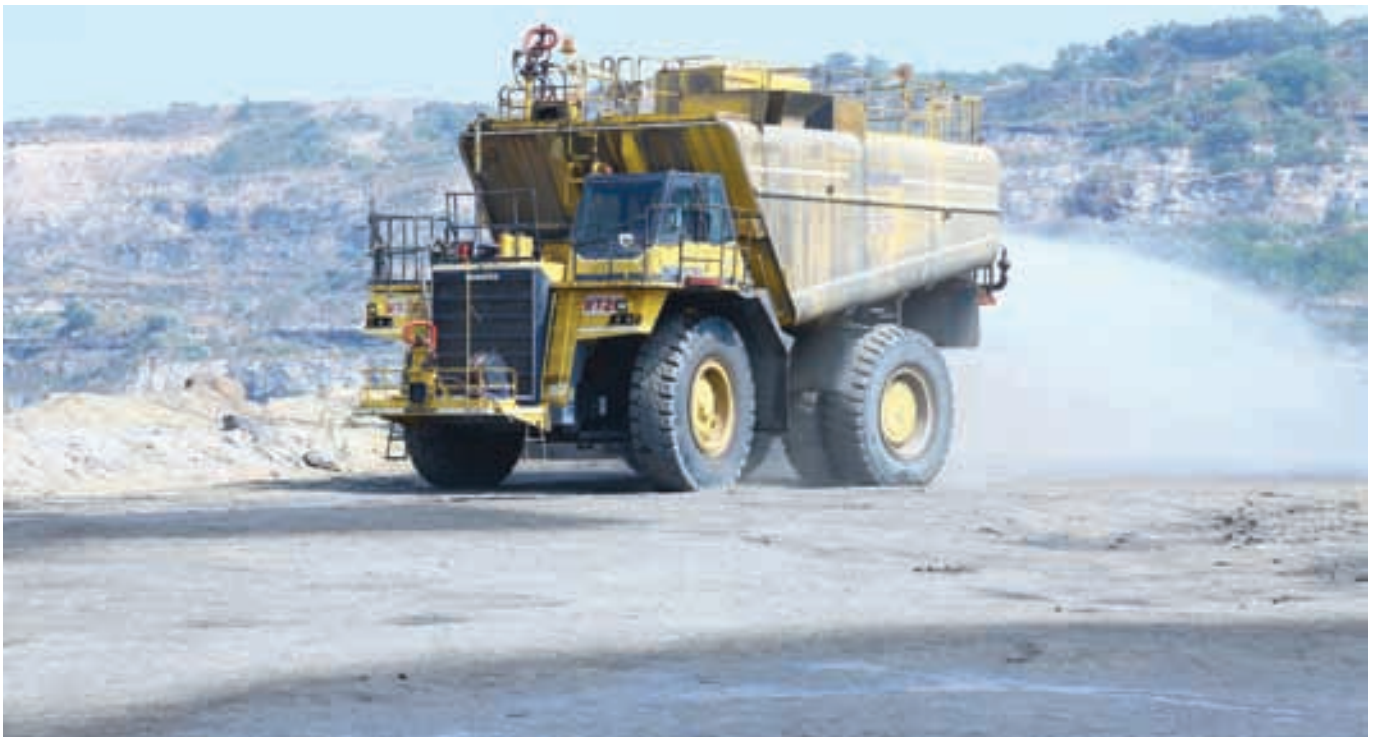
Dust suppression activity with water Sprinkler on Haul roads of OC mines