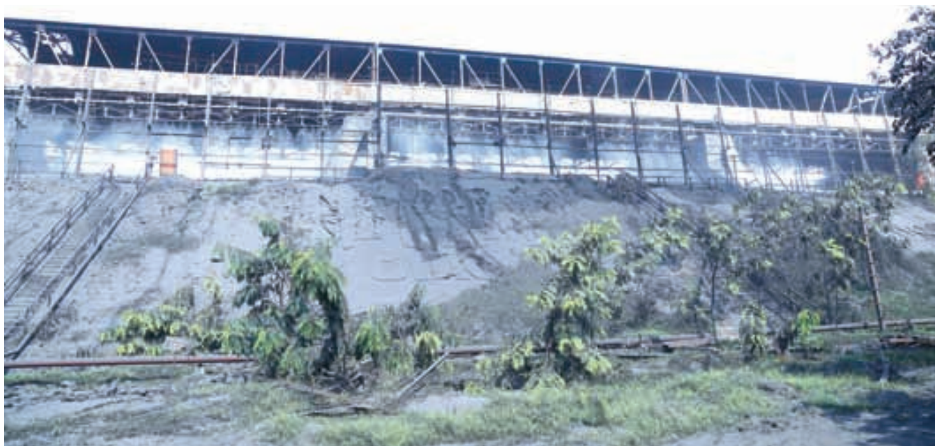
Dust suppression activity with Mist & Dry fog system at 16000 tonnes GL bunker, RG OC-3 CHP