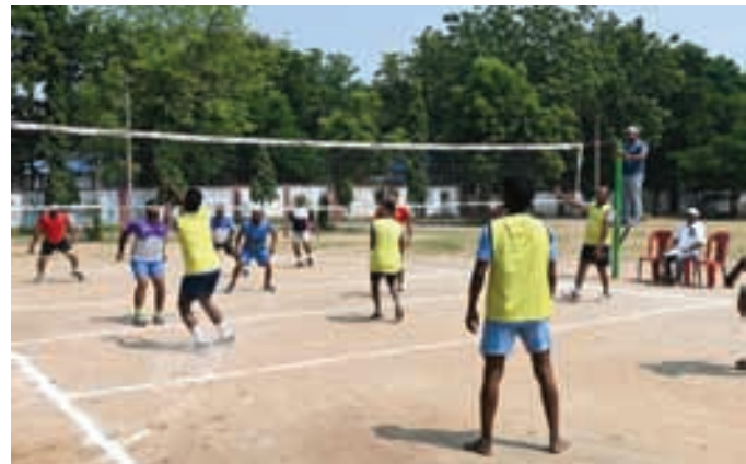
Company level Volleyball Tournament is organised by WPS&GA at Bellampally Area