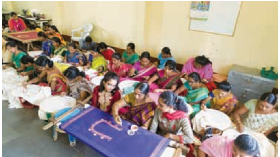
Women Empowerment : Various self employment training programs conducted for women