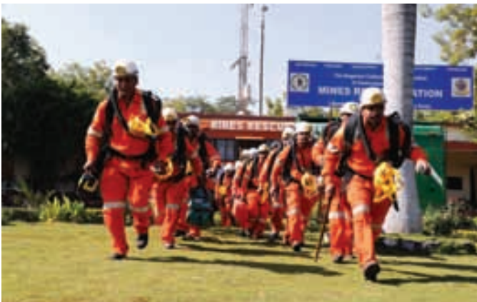
Trained Rescue teams with Modern Rescue Equipment (MRS, Ramagundem 2)