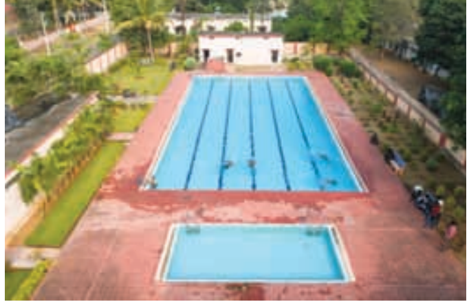
Swimming Pools in Residential Colonies