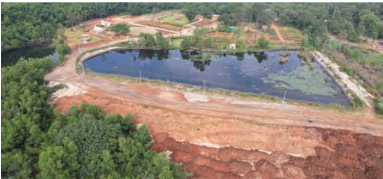
Eco park at GK OC premises Kothagudem