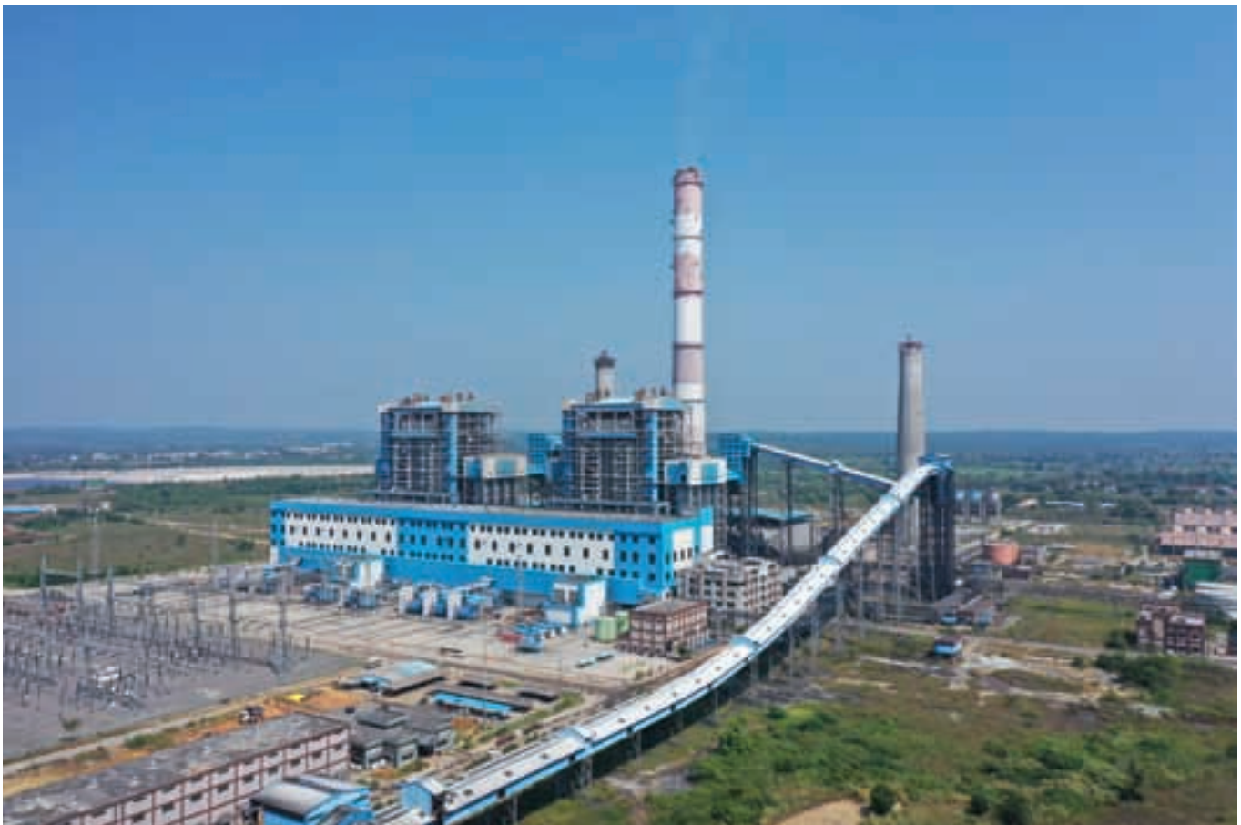
Singareni Thermal Power Plant (2X 600MW), Jaipur (Mancherial)