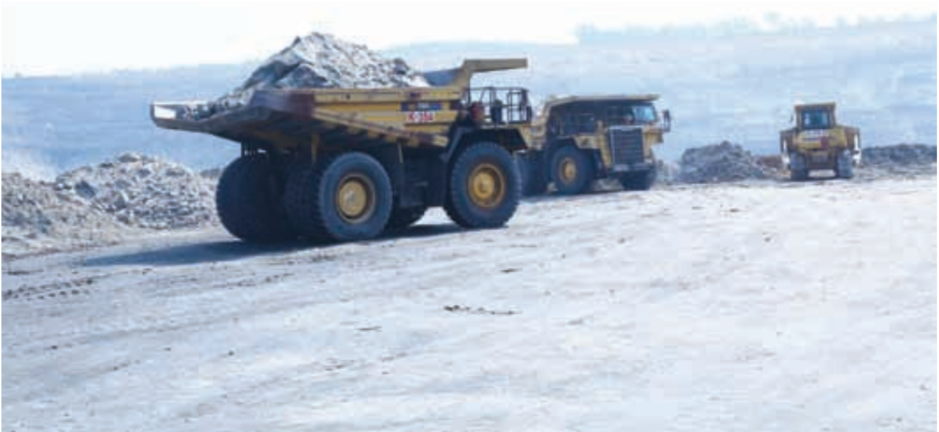
Back filling activity in Open Cost Mines (RG OC-1, RG 3 Area)

This report is to be read with my letter of even date which is given as Annexure 'A' and forms an integral part of this report.