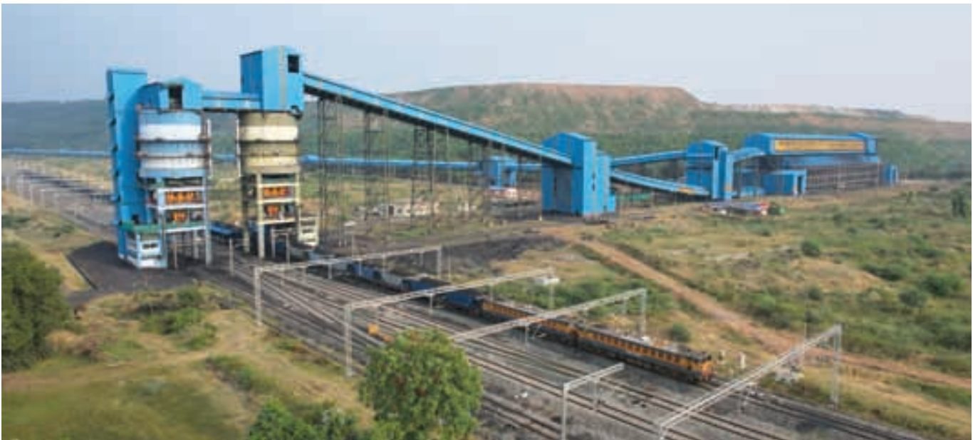
Eco - friendly CHP (10 MT capacity) commissioned at JVR OC mines, Sathupalli

The subsidiary Company provides warranty cost at 1% of the revenue progressively as and when it recognizes the revenue and maintain the same through the warranty period.