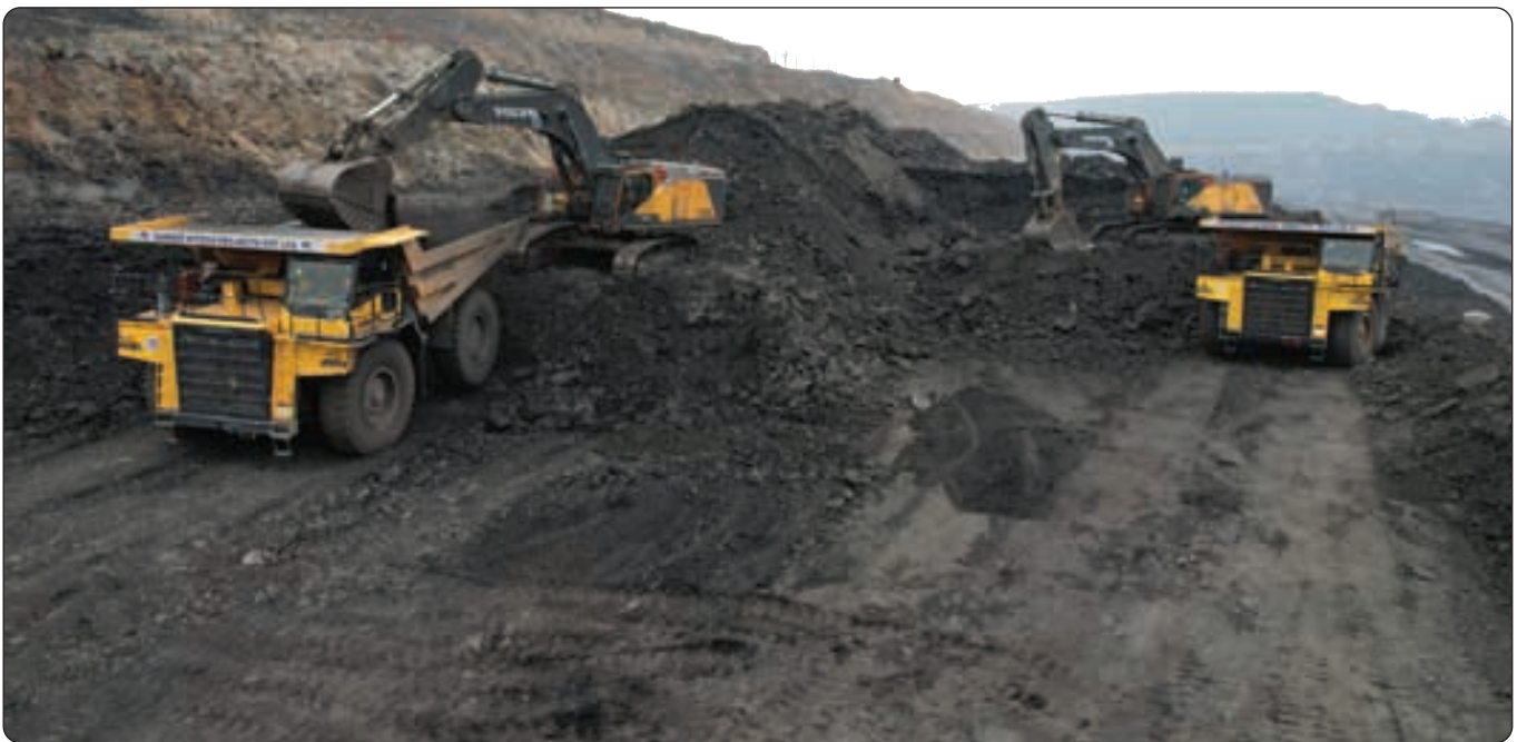
Coal Production in Open cast mine with Shovel, Dumper combination